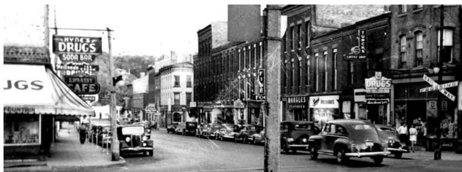
View of downtown Port Hope feat. Hyne's Drugs, c1940s

After World War I, the pharmaceutical profession became more heavily regulated. Pharmacists were required to attain a certain level of training, and acquire a licence from a recognized college or board of pharmacy. Pharmacy laws were also introduced to regulate the practice of labelling and dispensing medical drugs.